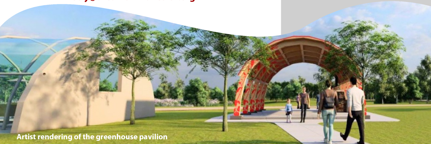
Artist rendering of the greenhouse pavilion

We accomplish this through community outreach programs, events, and collaborations. Each year, we impact around 15,000 people, including 2,000 youth.